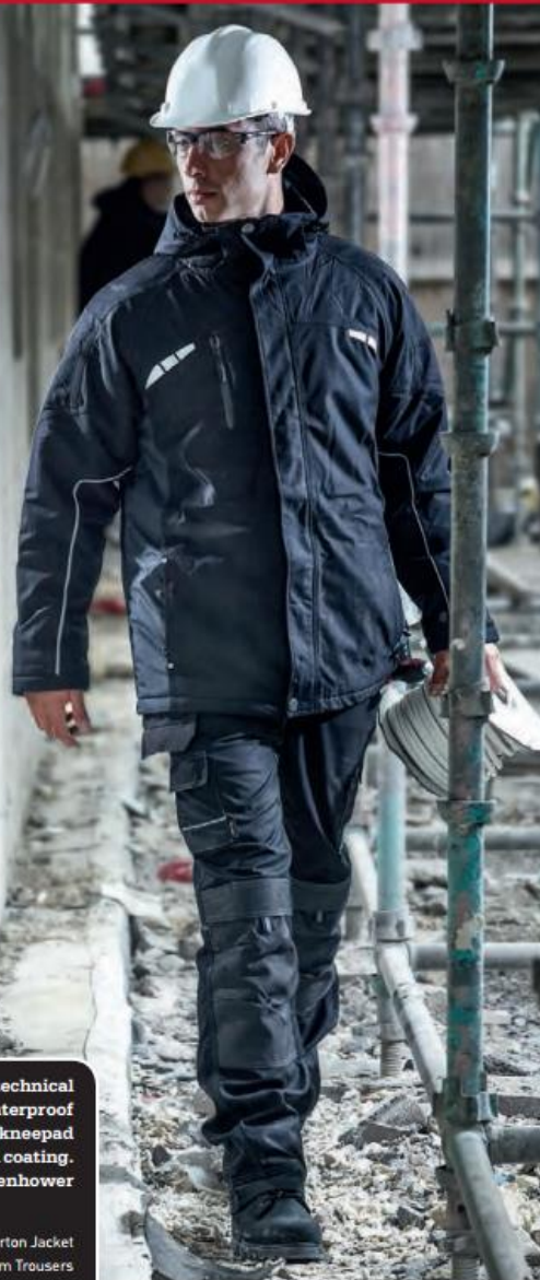
EH35000 - Atherton Jacket EH34000 - Eisenhower Premium Trousers

E isenhower gives you the best of technical workwear – from breathable, waterproof jackets to trousers with top-loading kneepad pockets, Cordura hemguards and Teflon coating. The job may be tough, but your Eisenhower clothing is tougher.