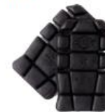
Dickies Knee Pads SA66 Page 163